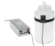
Steritest® Waste Overfilling Sensor for Solid Containers