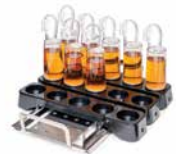
Steritest® Canisters Carrying Tray and Steritest® Rack