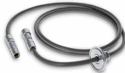
Figure 3. Steritest® Connection Cable Extension with Tri-Clover Clamp.