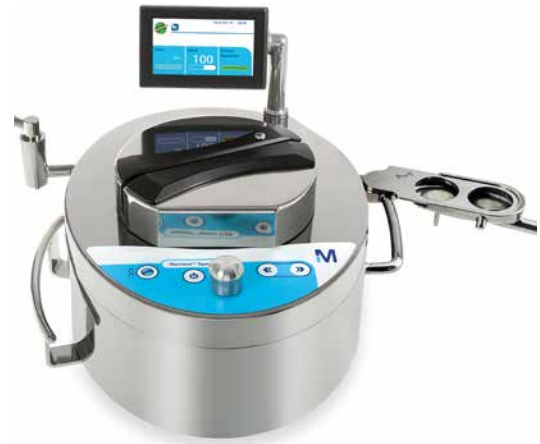
Figure 2. Steritest® Symbio FLEX Pump with Handles.