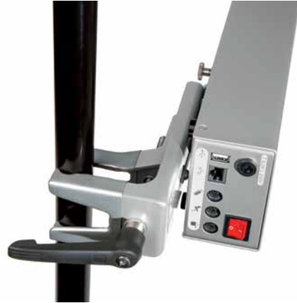
Figure 1. Steritest® Communication Hub Holder for Hoods.