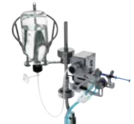
Steritest® Syringe Support