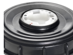
Dip tube showing the coding pins

Coding and orientation pins are at the code disk of the dispense head and at the dip tube to carry out a fast and safe adjustment of the two components to each other.