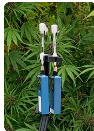
Outdoor measurement of terpenes from hemp growing operations using our glass and stainless steel Carbotrap® T420 TD tubes and Spectrex PAS-500 Personal Air Sampling pumps