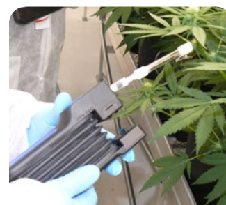
Indoor profile measurement of cannabis terpenes (flowering plant) from cannabis greenhouse growing operations using our glass Carbotrap® T420 TD tubes and detector tube pump