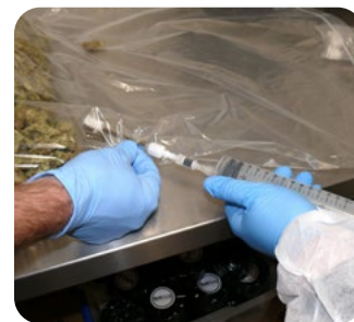
Indoor profile measurement of cannabis terpenes using headspace on dried plant materials from cannabis greenhouse growing operations using our stainless Carbotrap® T420 TD tubes and large syringe to pull the sample into our Carbotrap T420 TD tube.