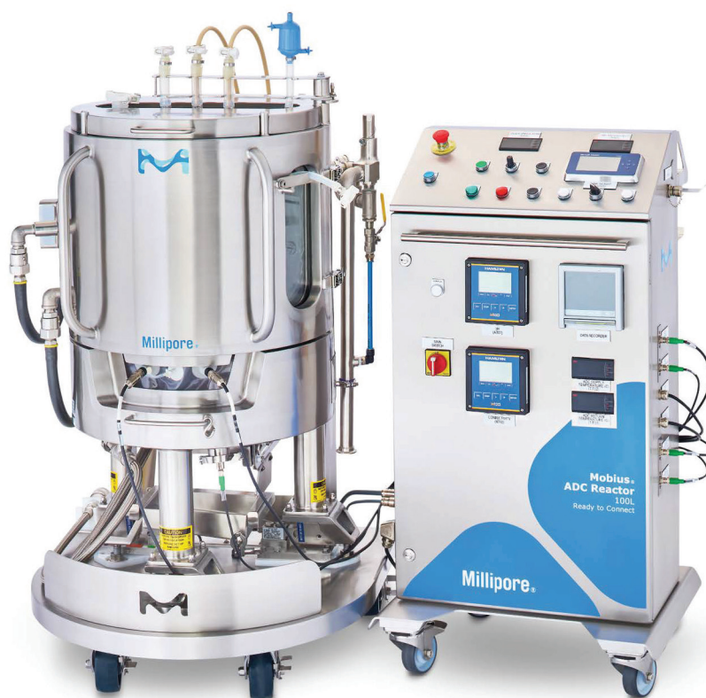
100 L Mobius® ADC Reactor with Ready to Connect Control Box.

The Mobius® ADC Reactor can be monitored and controlled locally or remotely. Plug the ready to connect control box to the network and use Ethernet IP communication protocol to monitor speed, weight, temperature, pH and conductivity remotely. The ready to connect control box is a separate box on a four wheels chassis that can be easily moved around the Mobius® ADC Reactor carrier. The 21 CFR Part 11 compliant data recorder option displays data trends in real time and ensures process data integrity when recording.