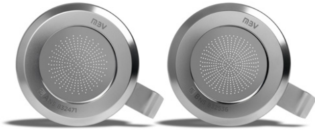
Figure 1. Comparison of the two different lids for MAS-100 Sirius® Air Samplers used for sampling with 100 SLPM (left) and 200 SLPM (right) with standard 90 mm agar plates.